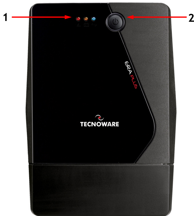
Figure 1 - Front panel